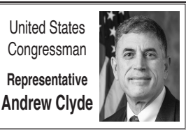
United States Congressman Representative Andrew Clyde

Last month, Senator Chuck Grassley revealed a smoking gun in the ongoing corruption case against the Biden Crime Family Syndicate.